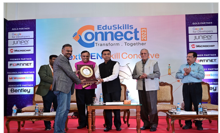
Photo: Goa Chief Minister Honouring Juniper at Felicitation Ceremony.

been honoured by EduSkills Foundation and AICTE NEAT in the last quarter of 2023. This prestigious recognition was conferred in the esteemed presence of Dr. Pramod Sawant, Chief Minister of Goa, acknowledging our unwavering commitment to reshaping the landscape of education and industry integration.