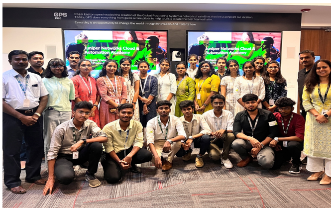
Photo: KPRIET team during lab walkthrough at Juniper, India.

Juniper Lab Walkthrough for Students of KPR Institute of Technology. On March 1st, 2024, JNCAA was delighted to welcome 20 students and a faculty member from the KPR Institute of Engineering and Technology (KPRIET) to the Juniper Networks Lab in Bangalore, India, with the aim of learning about various router and switch configurations and how they operate together to build networks in today's technologically driven era.