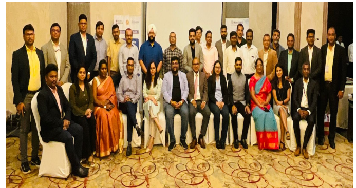
Photo: Attendees at the AICTE-EduSkills HR Roundtable.