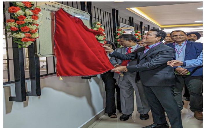
Photo: NHCIIE Inaugural Ceremony.

startup ideas sprouting from the ingenious minds of students at New Horizon College of Engineering, India. The inauguration of this remarkable collaboration unfolded with great enthusiasm at New Horizon College on February 14th. Distinguished guests graced the occasion, including industry stalwarts, renowned venture capitalists, a seasoned chartered accountant, and estee-